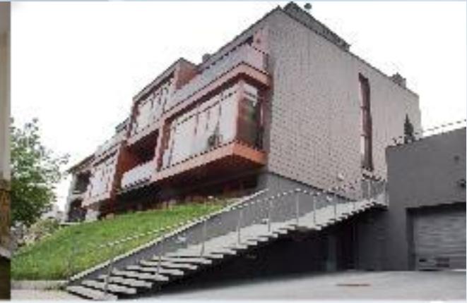
In 2005, 9 terrace houses were built in Kuosu street, Antakalnis district, Vilnius.