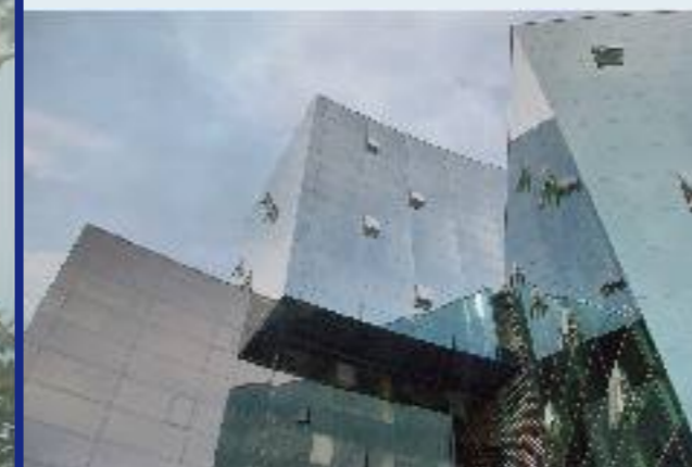
In the autumn of 2005, in Vilnius, where Ukmerges and Saltoniskiu streets meet, eight storey office building, one of the kind in Lithuania, has been started: the project of the building employs top of the range engineering and IT solutions. Total area of the building: ca. 8,000 m 2 .