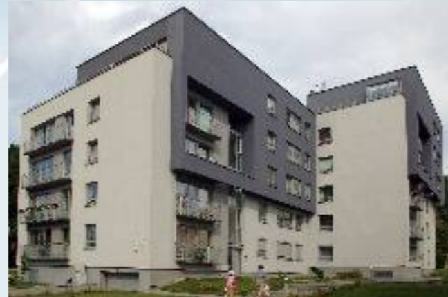
In 2001, 2 and 5 storey apartment blocks were built in Blindziu street, Zverynas district, Vilnius.

In 2005, 3 storey house with several apartments was built in Saules street, Antakalnis district, Vilnius .