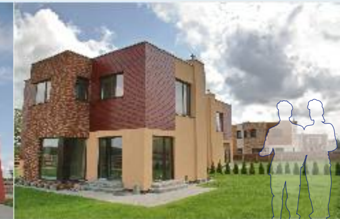
In the summer of 2005, construction works for residential area of 35 detached houses in the northern Vilnius, Naujasodziai, 6 km from Vilnius border near the road Vilnius-Panevezys, have been started.